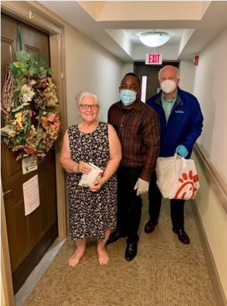
Posted by Christopher Bethel June 1, 2020