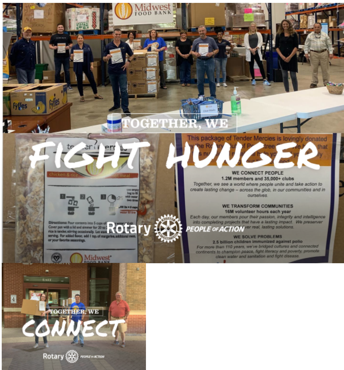
Posted by Mandy Timmons June 1, 2020