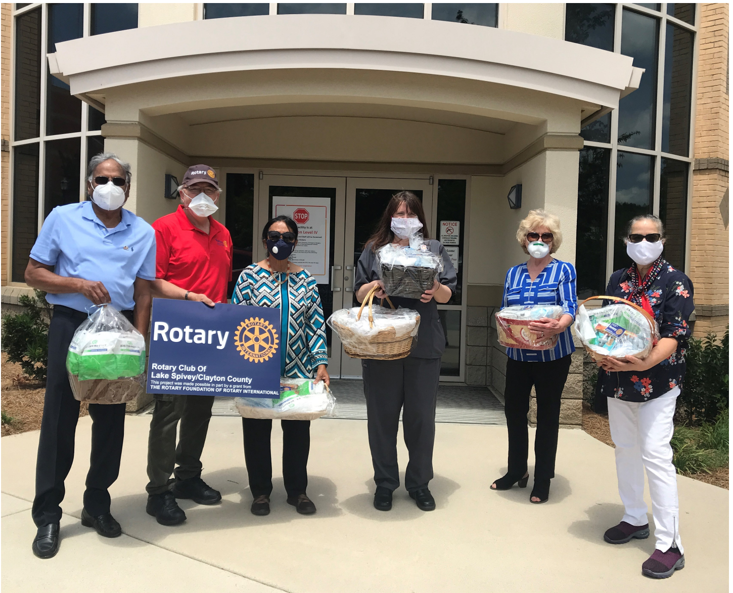
Posted by Ron Swofford May 28, 2020