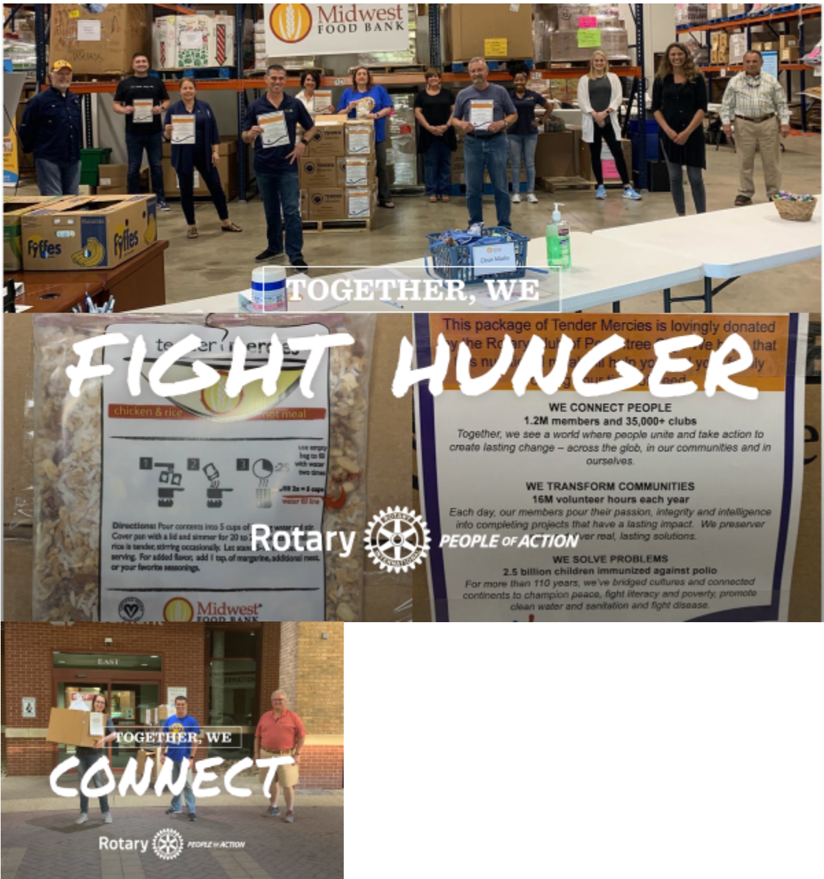
Posted by Mandy Timmons June 1, 2020