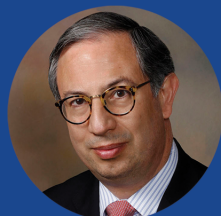
Carlos del Rio