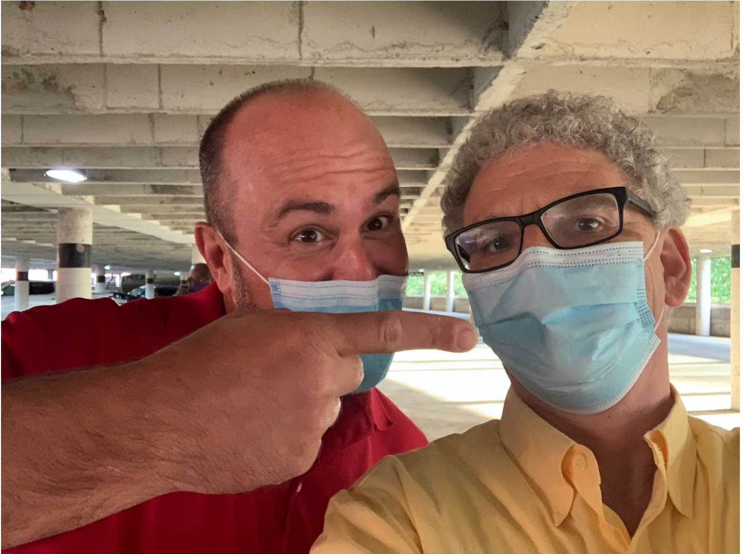
Posted by Ian Bond November 8, 2020