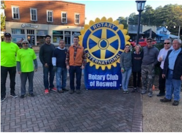
Posted by Trummie Patrick November 1, 2020