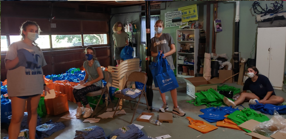
Pope High School Interactors help with tee-shirts and hats for this year's race