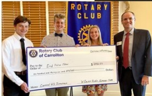
Above: Carrollton Rotary extends Many, many thanks to the Central High School Interact Club for its donation to our End Polio Now campaign!