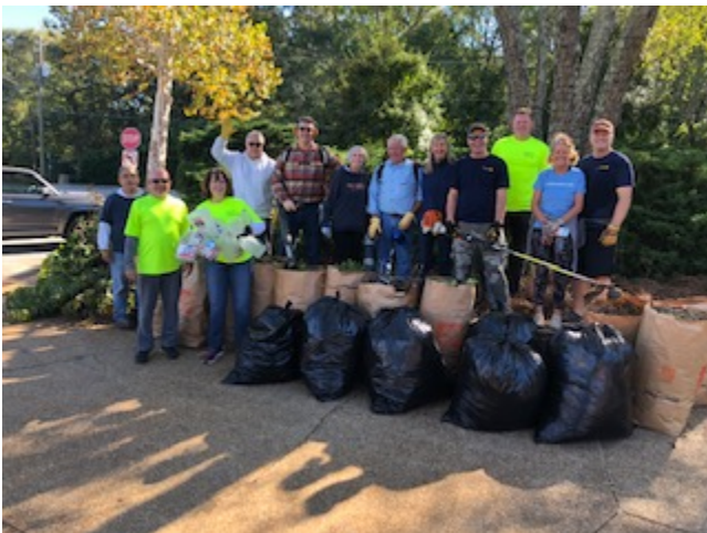
Roswell Rotary and Historic Roswell Beautification Project joined forces Saturday, Oct. 17 to landscape