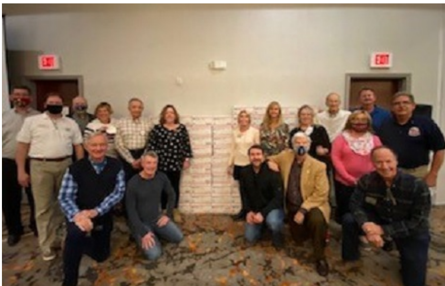
Posted by Trummie Patrick January 10, 2021