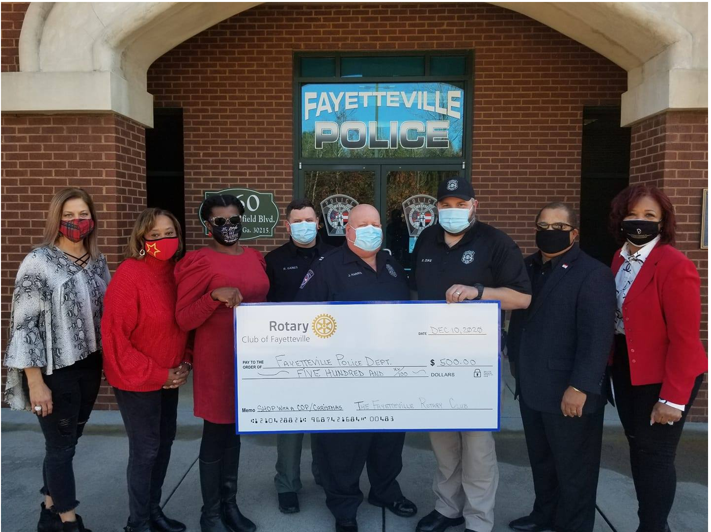
The Rotary Club of Fayetteville was happy to partner with the Fayetteville Police Department with a donation for their annual Shop With A Cop program!