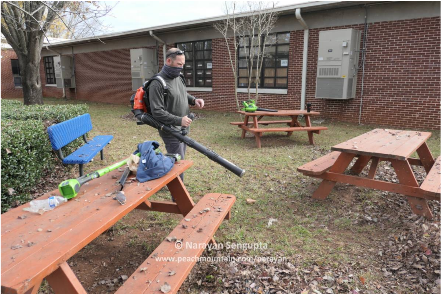
Posted by Narayan Sengupta January 10, 2021