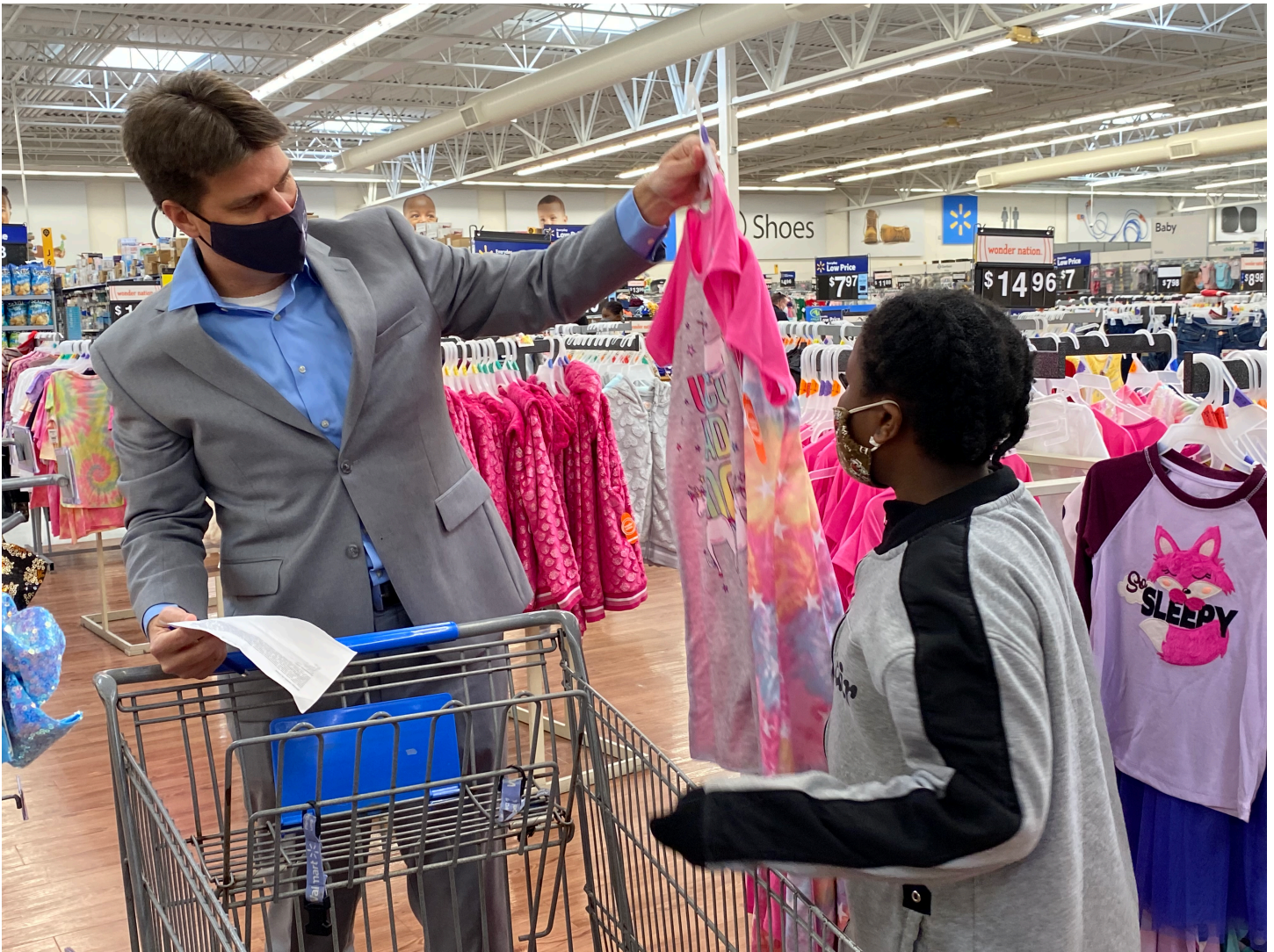
Posted by Samantha Rosado January 10, 2021