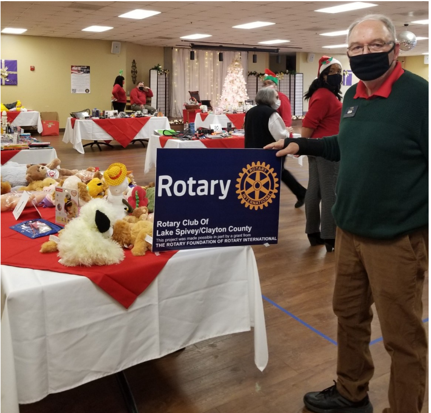
Posted by Ron Swofford January 10, 2021