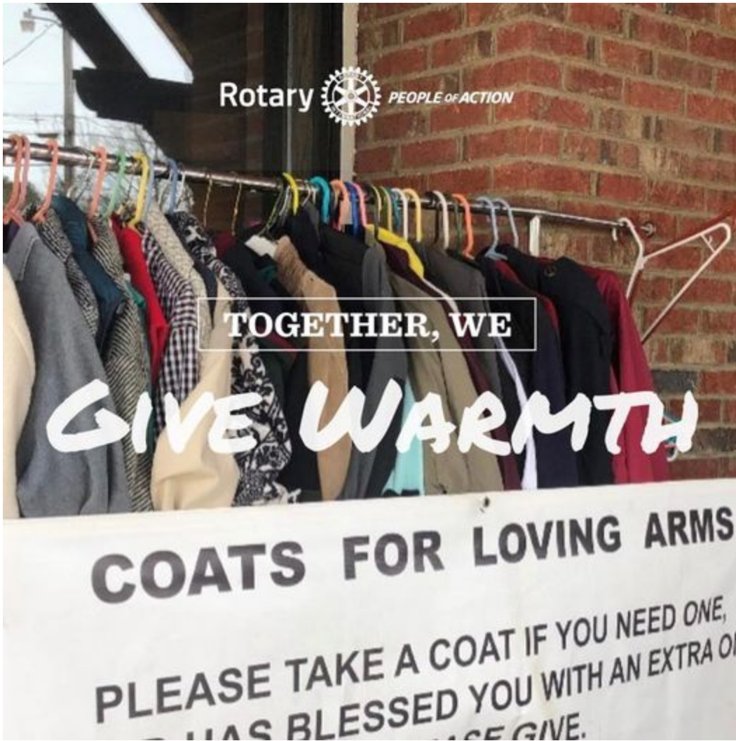
Posted by Jackie Cuthbert January 31, 2021