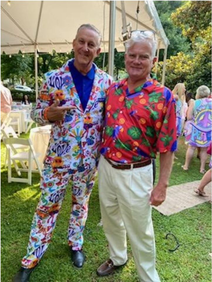
Posted by Becky Nelson July 2, 2021