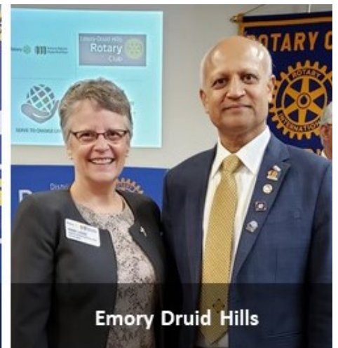
Emory Druid Hills