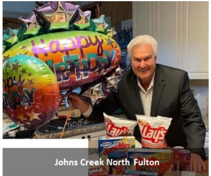
Johns Creek North Fulton