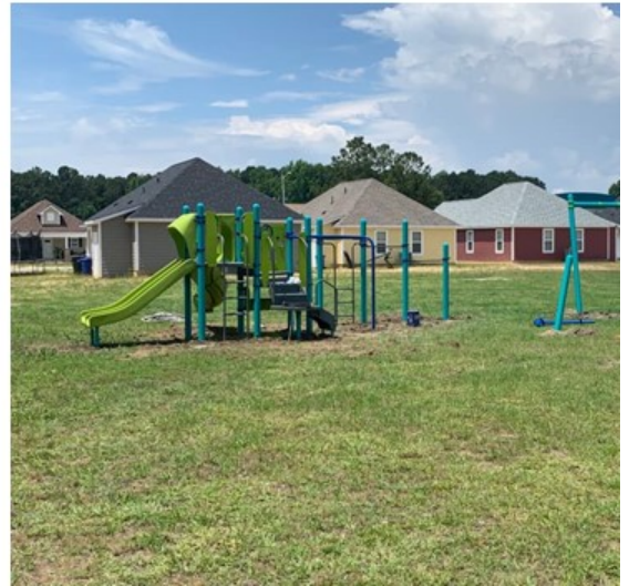
Posted by Jackie Cuthbert July 6, 2021