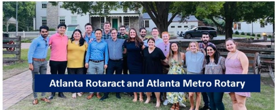
Atlanta Rotaract and Atlanta Metro Rotary