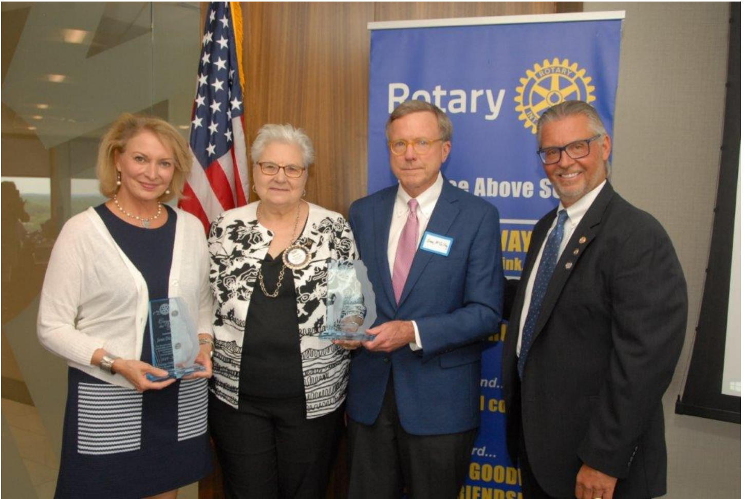
Posted by Brenda Borden July 2, 2021