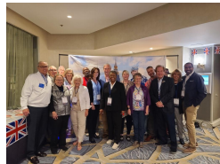
District 6900-PDGs, DG, DGE, DGN & Emerging leaders.