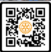
Rotary Club of Atlanta Hosts Community Clean-Up Project

The Rotary Club of Atlanta hosted a community clean-up project, which was a great success. The project provided a valuable opportunity for members to learn more about the impact of polio and how they can help in the fight against this disease. We are proud to be a part of the solution and to see the positive change we are making in the world.