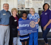
Rotary Club of Atlanta Hosts Community Clean-Up Project

The Rotary Club of Atlanta hosted a community clean-up project, which was a great success. The project provided a valuable opportunity for members to learn more about the impact of polio and how they can help in the fight against this disease. We are proud to be a part of the solution and to see the positive change we are making in the world.