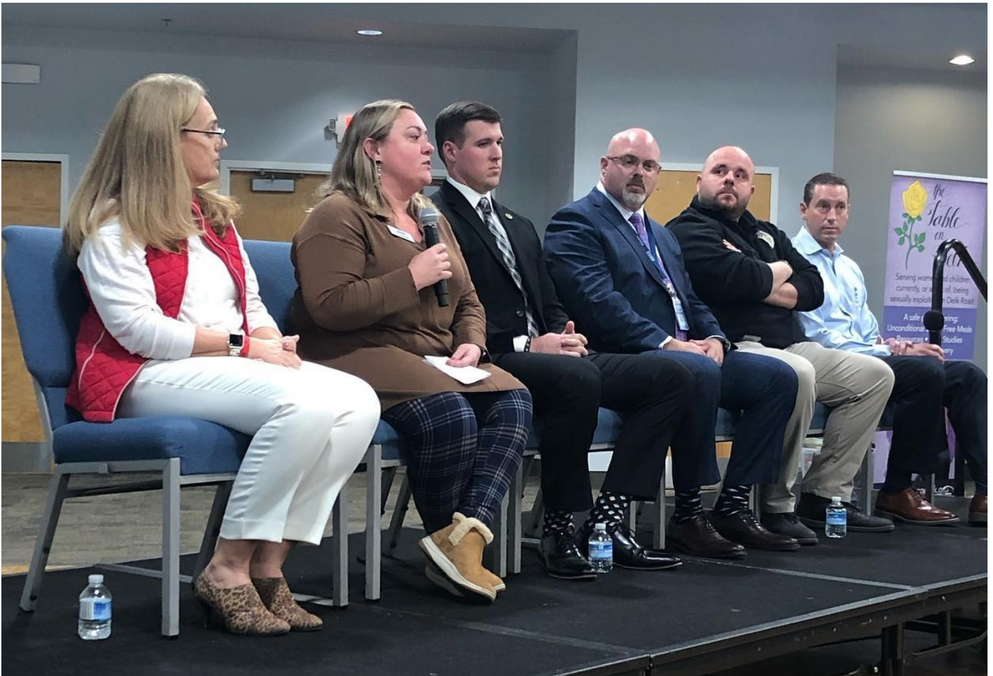
Posted by Hicks Malonson March 27, 2023