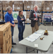
It's a Matter of Empowering and Making a Difference - Why We Celebrate

Rotary is proud to celebrate the achievements of our members and the impact they have made in their communities. This year, we have seen a record number of projects completed and a record number of people inspired to get involved. We are proud to be a part of the solution and to see the positive change we are making in the world.