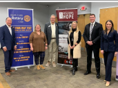
Rotary Club of Atlanta Hosts Community Clean-Up Project

The Rotary Club of Atlanta hosted a community clean-up project, which was a great success. The project provided a valuable opportunity for members to learn more about the impact of polio and how they can help in the fight against this disease. We are proud to be a part of the solution and to see the positive change we are making in the world.