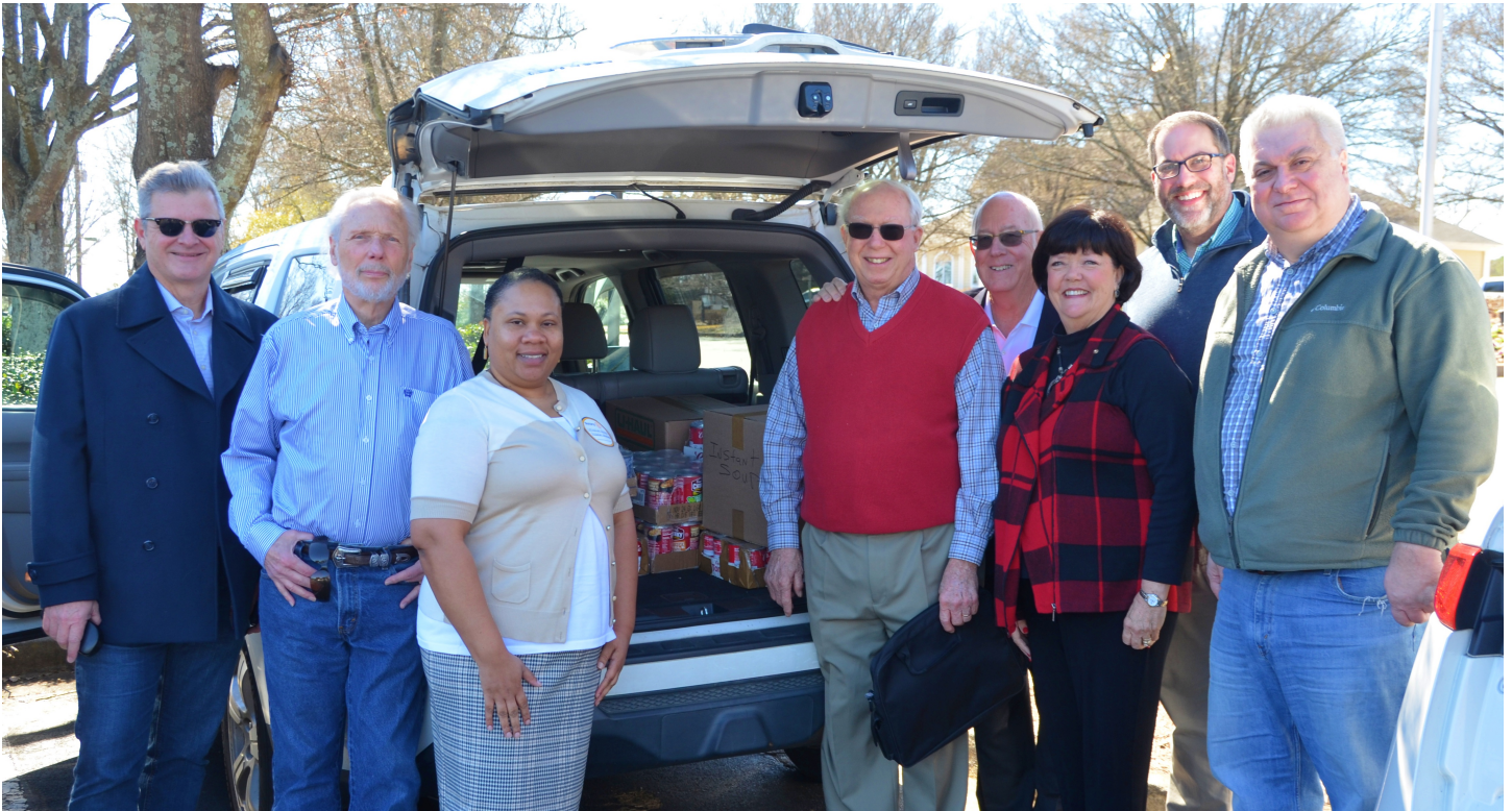
Posted by Sally Platt March 27, 2023