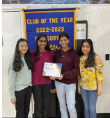
2023 District Board Day 10th Review

[Name] has been honored with the 2023 District Board Day 10th Review award for their outstanding contributions to the community. We are proud to recognize their leadership and dedication.