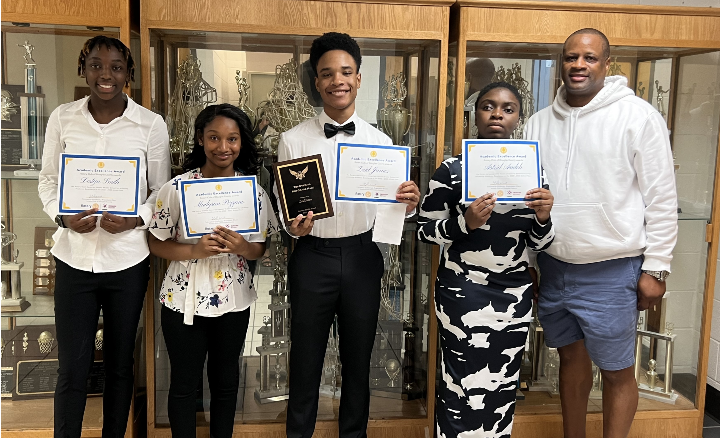
Posted by Nell Boggs