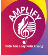
Area 13 Amplify Rotary at 2023 District Conference - Registration Open

We are seeking applications for community grants for the 2023-2024 fiscal year. The grants are intended to support projects that benefit the community and promote the Rotary Ideal. Applications should be submitted by [Deadline]. For more information, visit [Website].