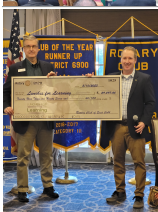
2023 District Board Day 10th Review

The public hearing was held on [Date] at [Location] to discuss the proposed [Project Name]. The hearing was attended by [Number] community members who provided valuable input and feedback.