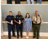
2023 District Board Day 10th Review

[Name] has been recognized as the winner of the 2023 District Board Day 10th Review. We congratulate her on this well-deserved honor and thank her for her commitment to service.