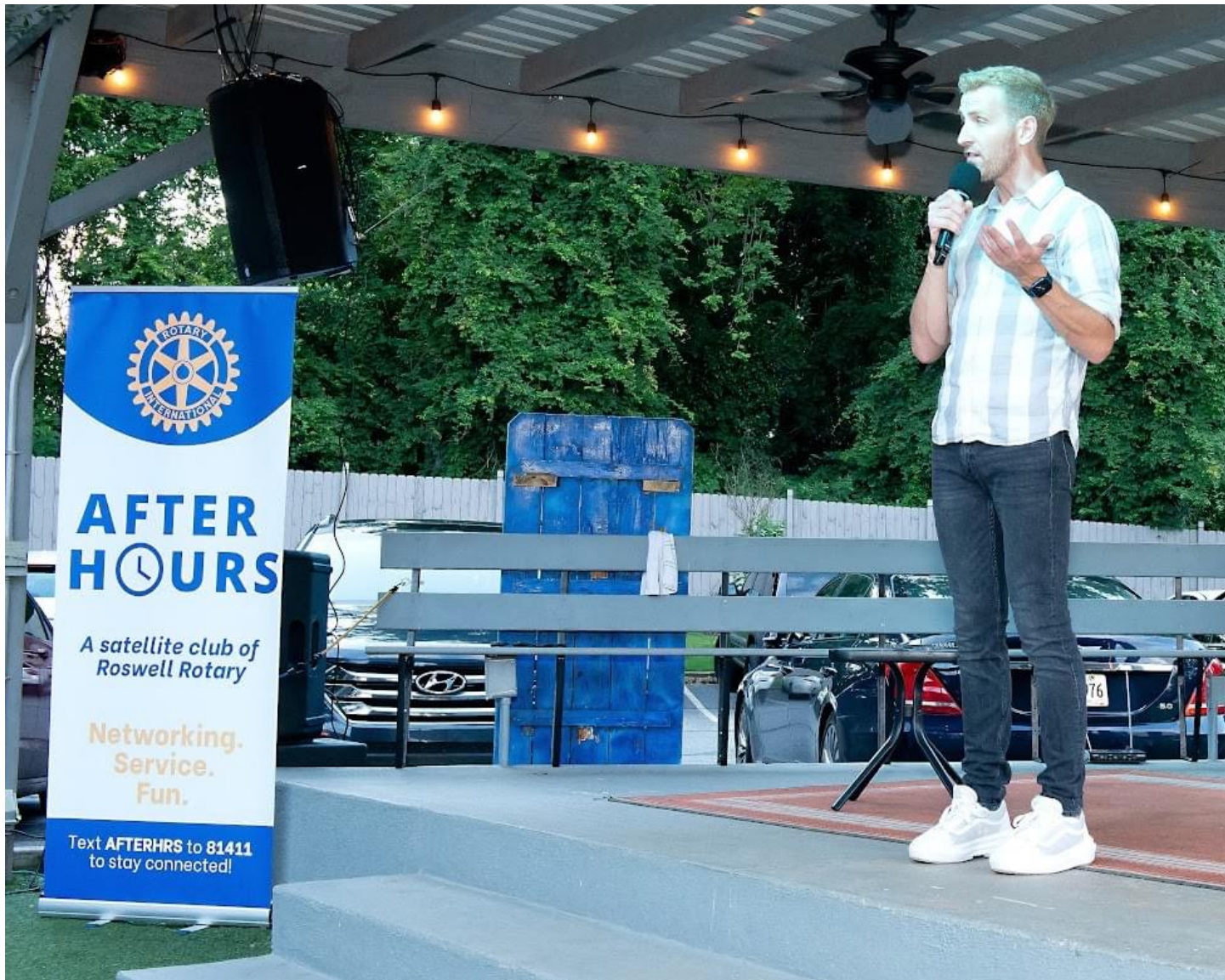
Posted by Becky Nelson July 5, 2023