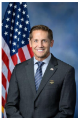
Dr. Rich McCormick

Congressman Georgia's 6th Congressional District