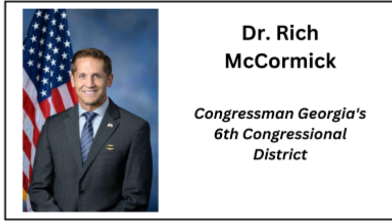
Dr. Rich McCormick

Congressman Georgia's 6th Congressional District