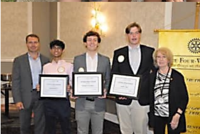
Posted by Sally Platt August 22, 2023