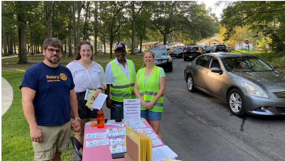
One hundred vehicles were already lined up prior to opening the Fresh Produce Market that morning!