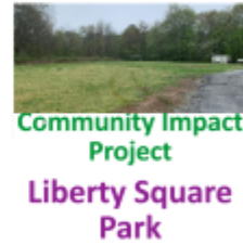
Liberty Square Park Cleanup 8am - 12pm See Gabriel Prado

We need help on September 16th! Starting with our Liberty Park Clean Up, to Rivers Alive Cleanup, and then 9/11 Cookout! What times can you sign up for?