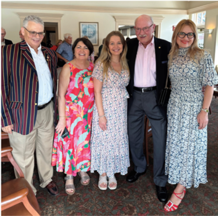
Posted by Julie Bond October 1, 2023