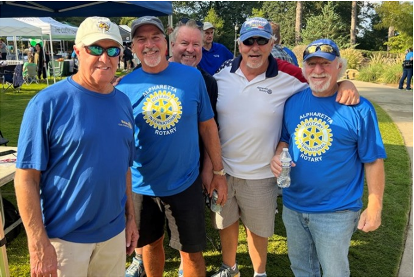
Posted by Clark Savage October 30, 2023