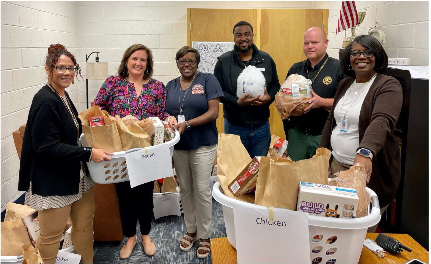
Posted by Nell Boggs November 29, 2023