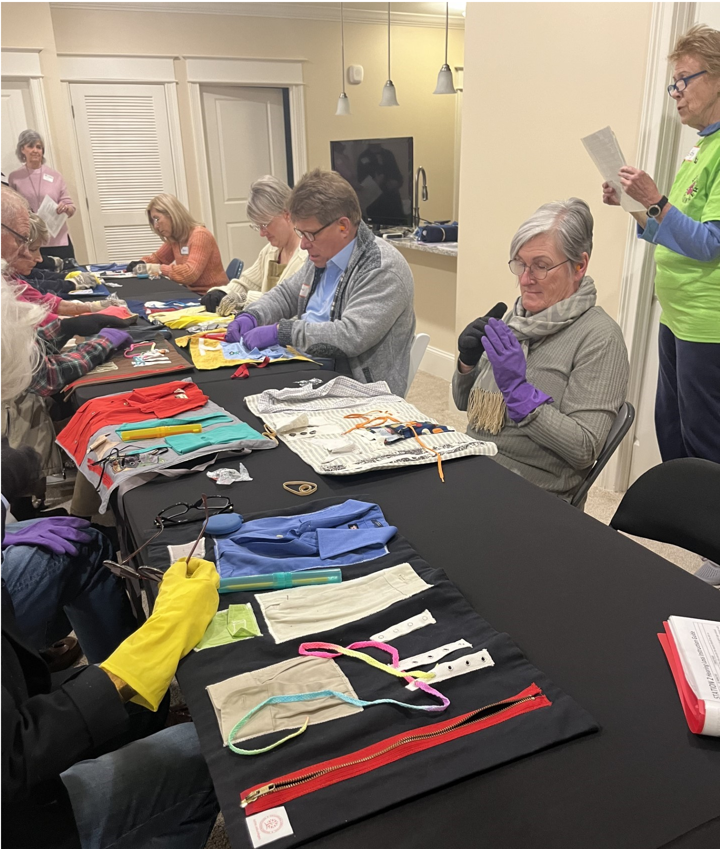
Posted by Nancy Prochaska January 30, 2024