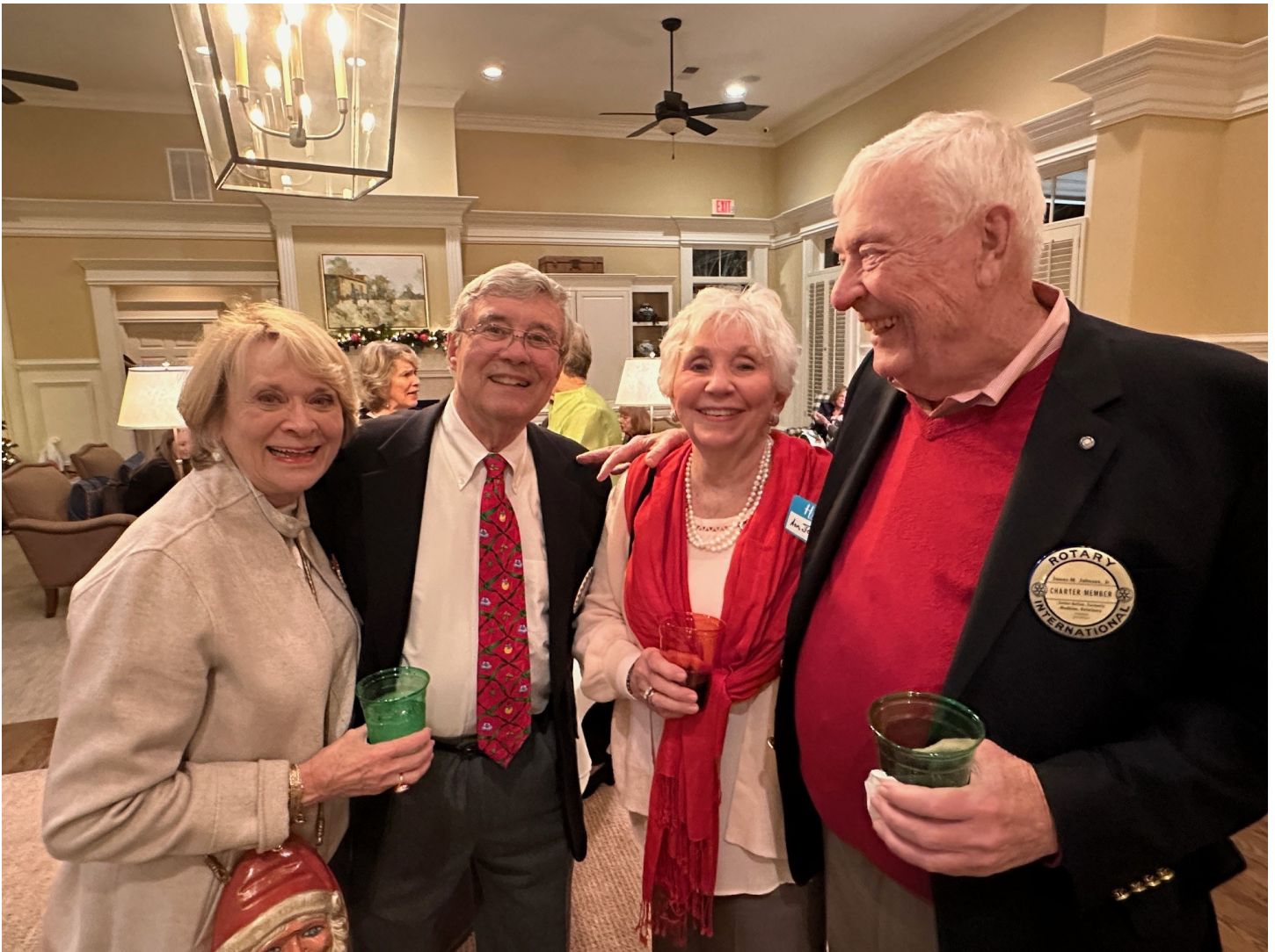
Posted by Brenda Borden January 29, 2024