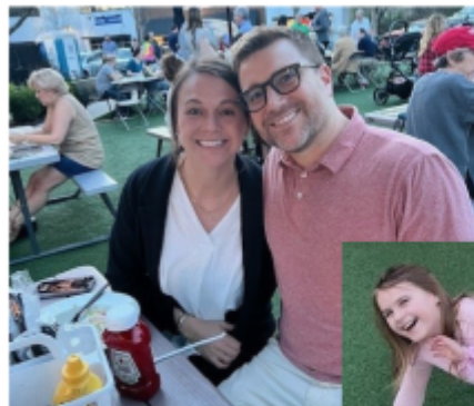
Over the Hump Day