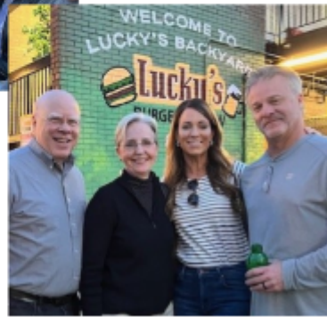
Over the Hump Day