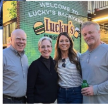
Over the Hump Day