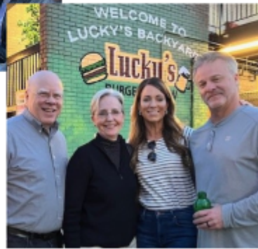
Over the Hump Day