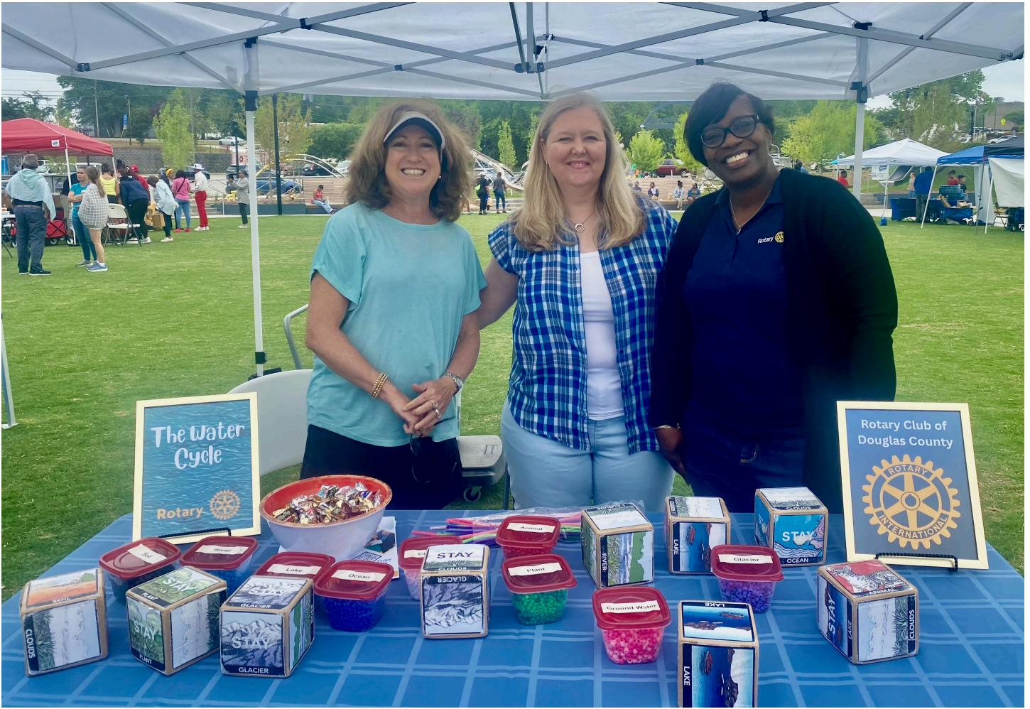
The Rotary Club of Douglas County joined in the Earth Day event at Douglasville's new Town Green! Kids young and old had fun making bead bracelets and learning about the water cycle.