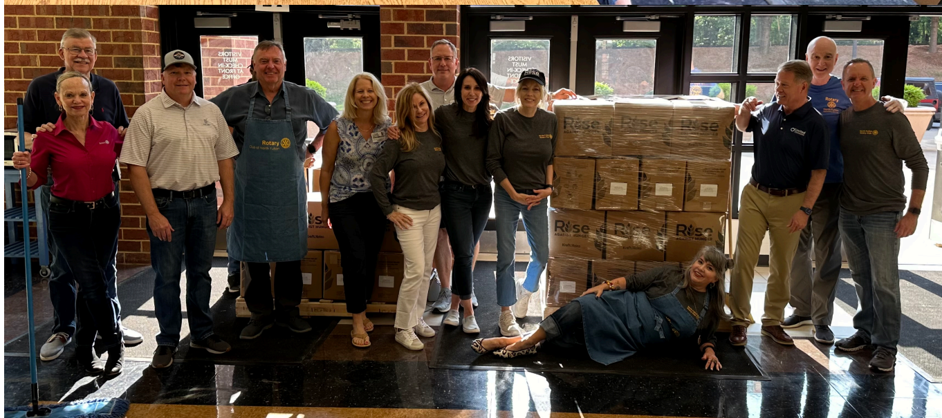
Posted by Lisa Gelber May 5, 2024