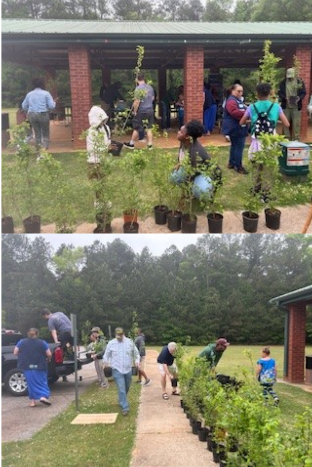
Posted by Amy Lemelin May 5, 2024