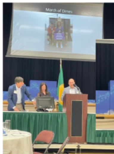
Last Week at Rotary