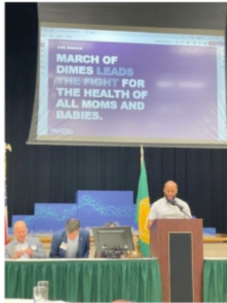
Last Week at Rotary