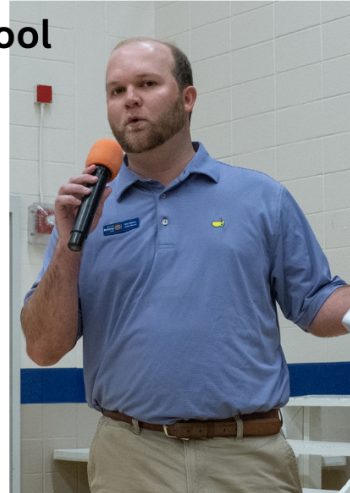
Comedy for a Cause