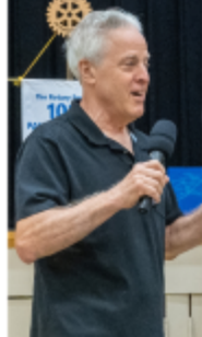
Mr. Committee Chair