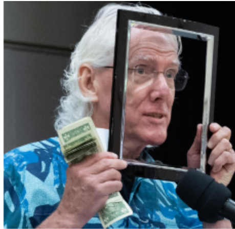
Roswell Rotary Squares Fun