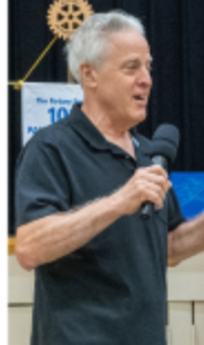
Mr. Committee Chair