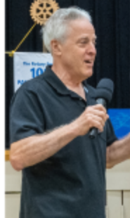
Mr. Committee Chair