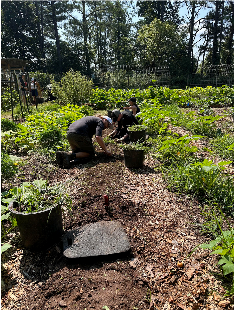
Last Week at Roswell Rotary