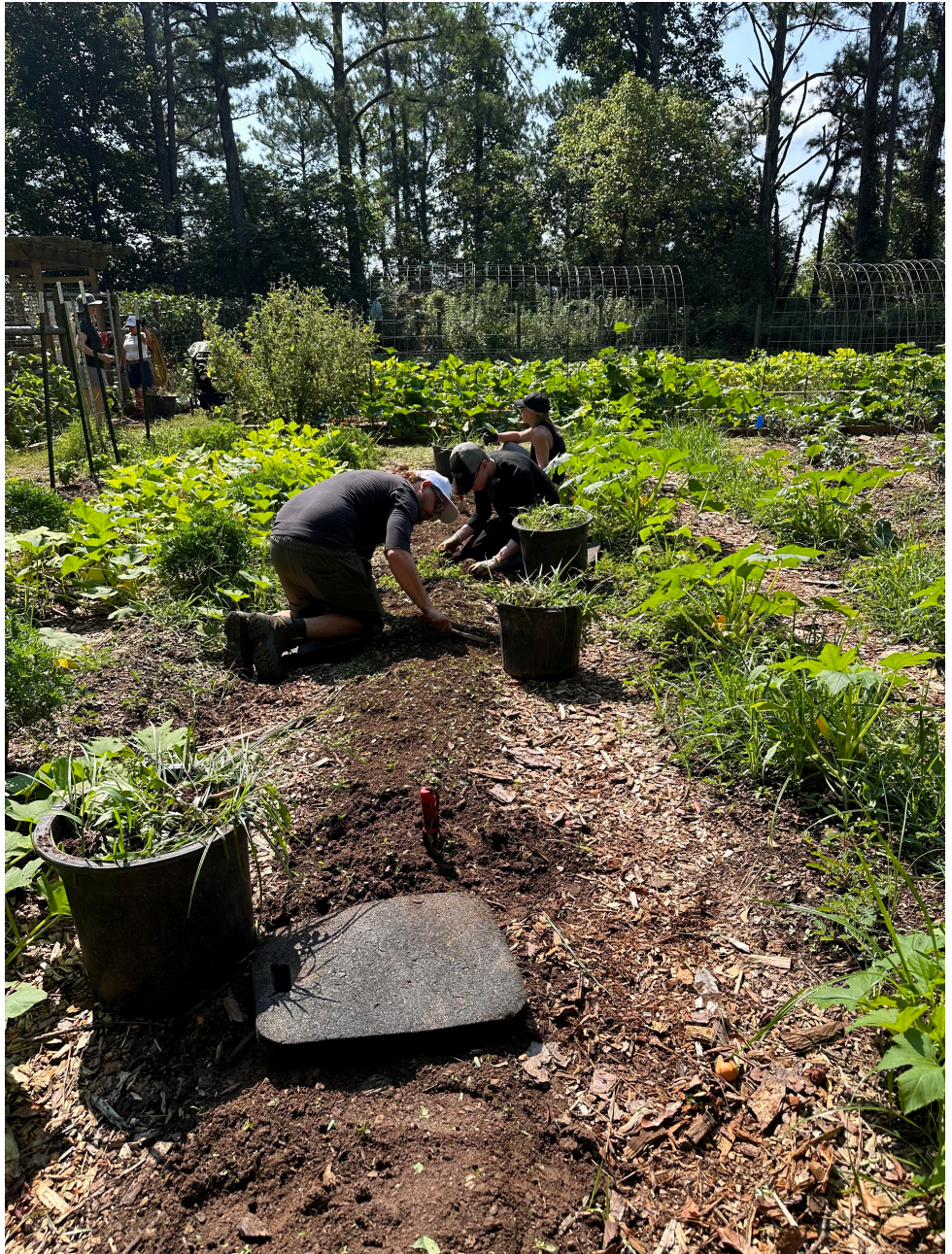
Last Week at Roswell Rotary