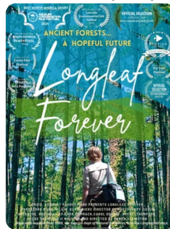
Wednesday, Sept. 18

Magic Kumquat Productions creates documentary films with stories that engage, inspire and move viewers. The productions are dynamic and curiosity-driven, focusing on the natural world and remarkable individuals. Learn more about the duo and their films during our meeting.