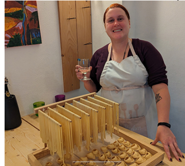
Thursday, Sept. 5