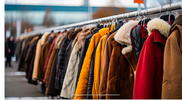
Thursday, Sept. 5