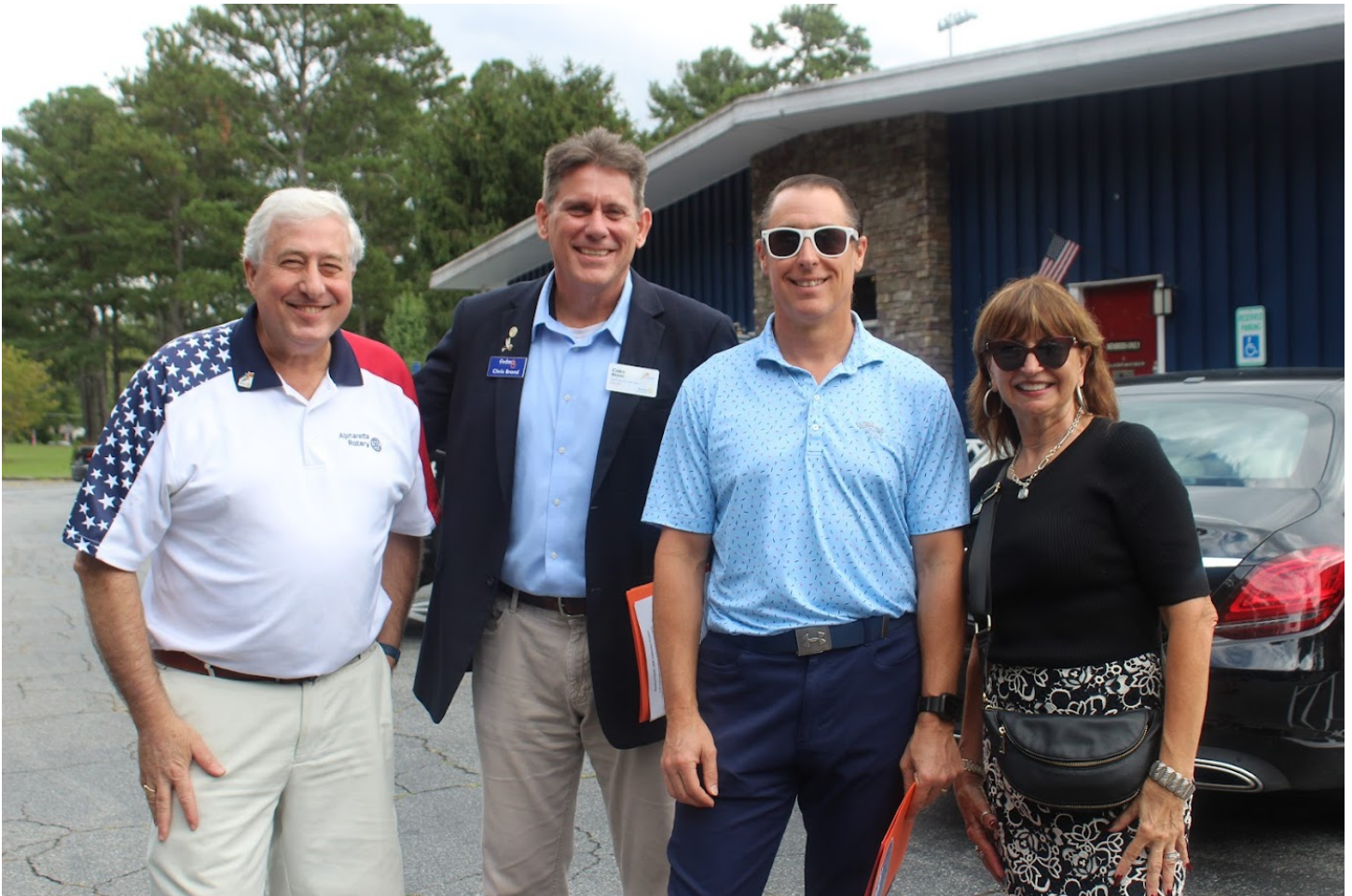
Posted by Kathryn Igou October 2, 2024