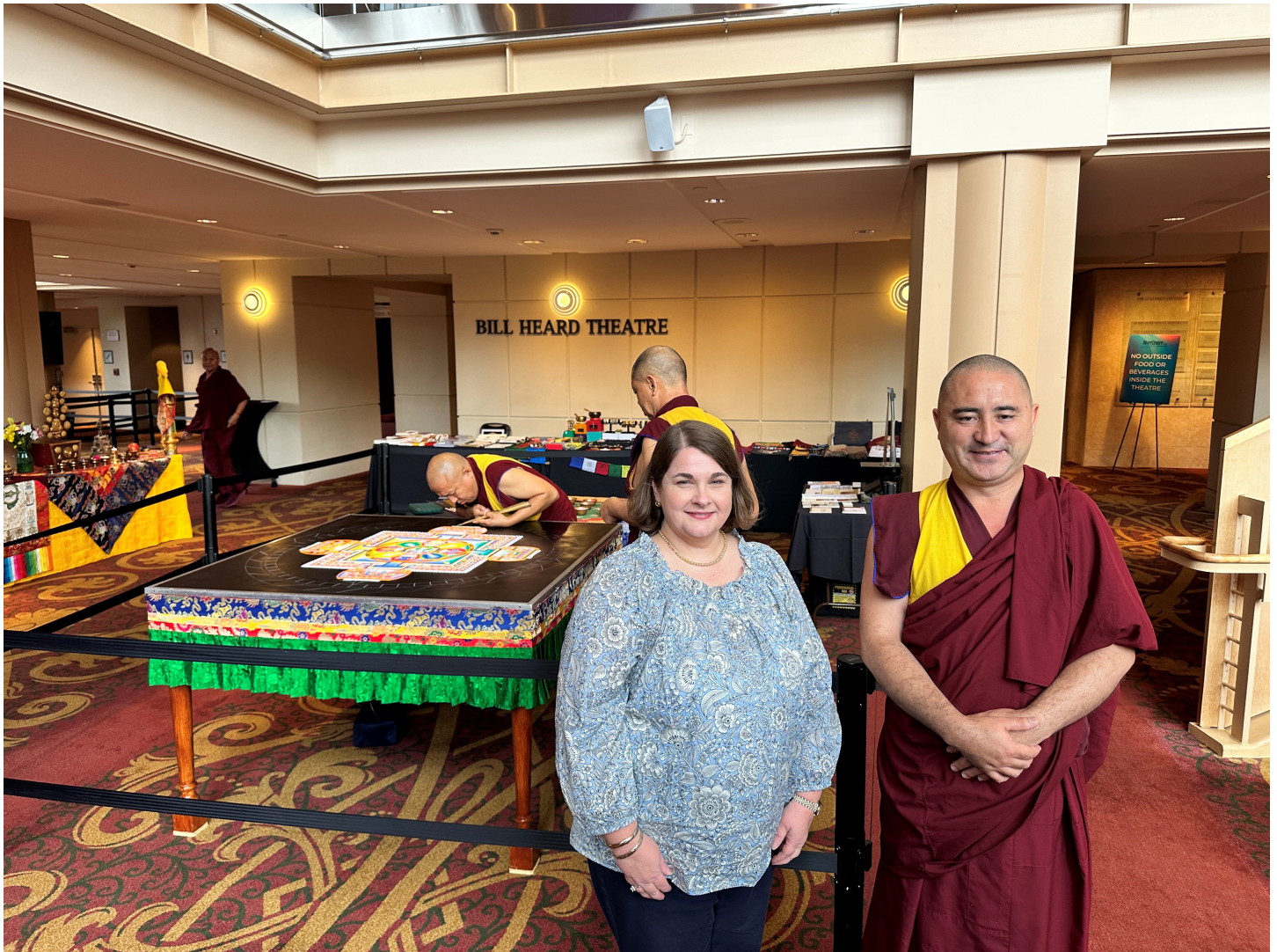
Posted by LeighAnn Dicesaris October 2, 2024