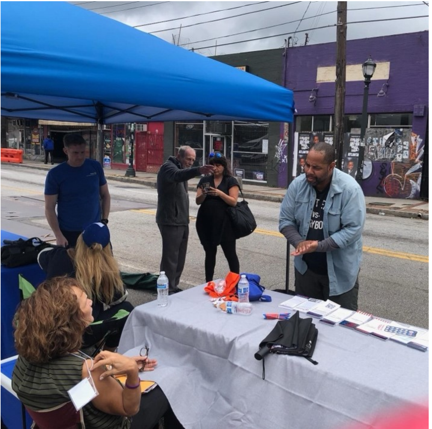
Posted by Jared Evans October 2, 2024

Accessibility | Belonging | Inclusion | Diversity | Equity