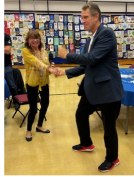
Dancing in the Gym