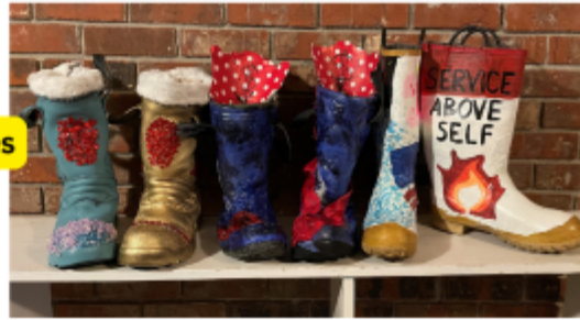
Boots for Heroes

Welcome Welcome Welcome to all who come to the Roswell Rotary meeting this Thursday for lunch. We will not only be hosting 13 of our 16 Interact Clubs but also the City of Roswell Youth Ambassadors for the Youth Day Parade on Saturday, Oct 3rd. This meeting is always inspiring and gives us the very face of hope on our stage.