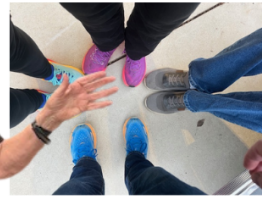
The Service Project Magician