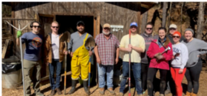
The Roswell Rotary After Hours Club working on the Unity Garden at the Chattahoochee Nature Center.

Roswell Rotary supports environmental sustainability through its After Hours Club, which repurposes plastic grocery bags to aid produce transport from the Chattahoochee Nature Center's Unity Garden to the North Fulton Community Charities local food pantry. The group also actively participates in Georgia's annual "Sweep the Hooch" river cleanup and other city park beautification projects.