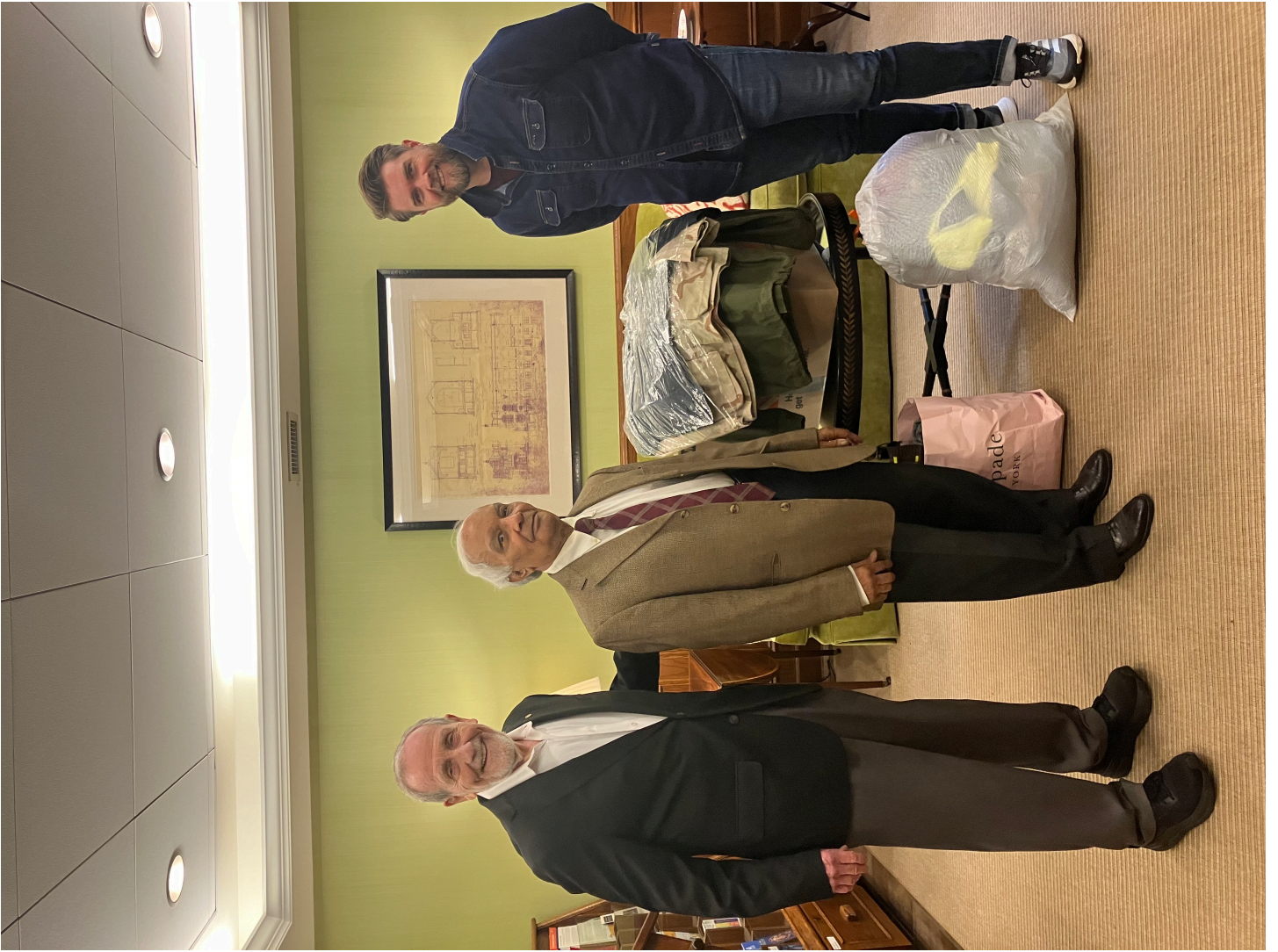
Posted by Angeli Abrol Duggal January 3, 2025