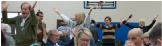
Dancing to Get the Meeting Started