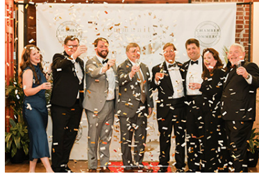
Thursday, March 6