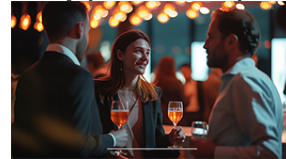
Friday, March 7