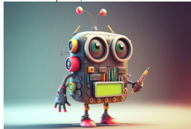
Thursday, March 6

They will bring their award winning bot and their epic STEM skills to Rotary. Watch their robot take on real competitive challenges and maybe get a chance to test your own skills. This presentation will highlight innovation, competition, and a whole lot of fun.