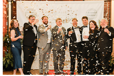
Thursday, March 6

Congratulations to these Rotarians for their well-deserved recognition!