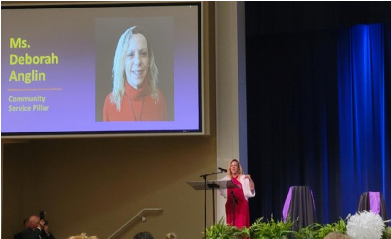
Posted by Judith Bennett March 30, 2025