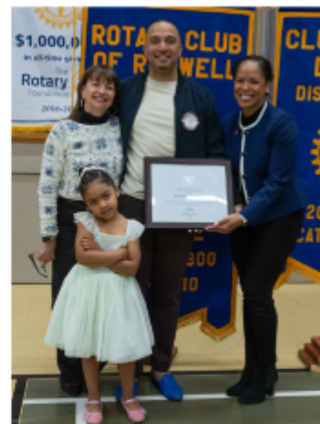
Frederick Levy Award for Hours of Service