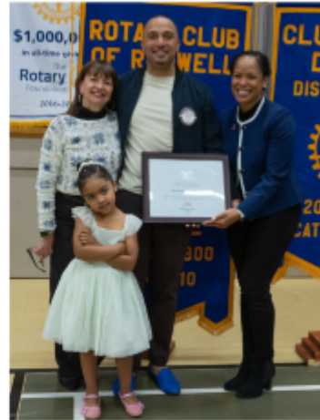
Frederick Levy Award for Hours of Service