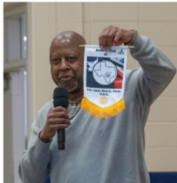
Go New Members!!!