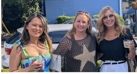
Alive in Roswell