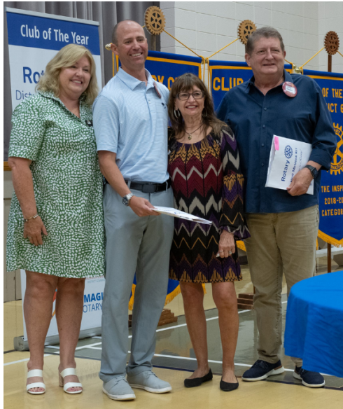
Celebrating New Members