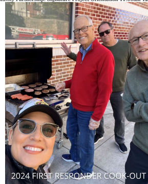
2024 FIRST RESPONDER COOK-OUT