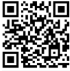
Golf & Tennis