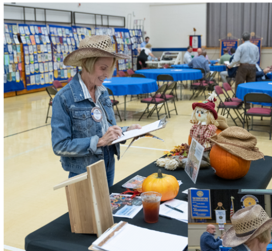
Excited about Farm Day for First Responders