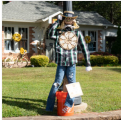
Scarecrow # 88 -Rota Lee

Vote for Roswell Rotary Scarecrow on Canton St.