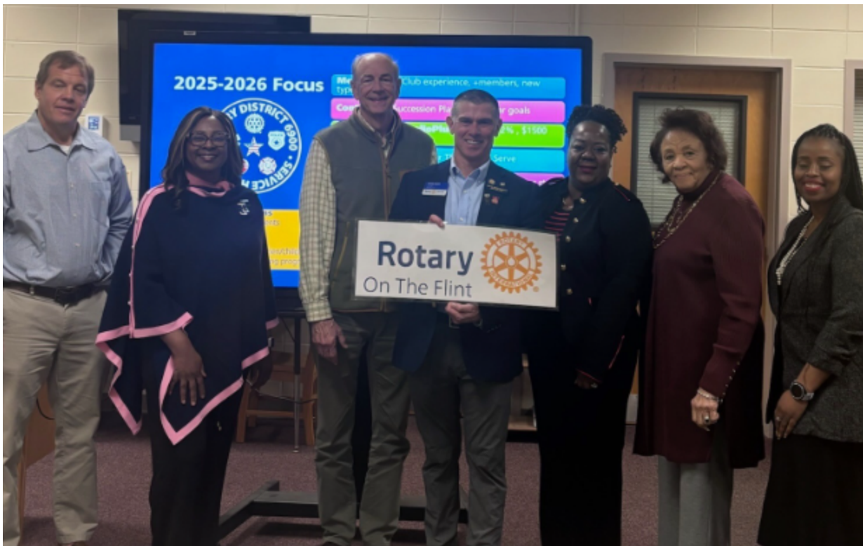
Posted by Steve Ivory February 4, 2026