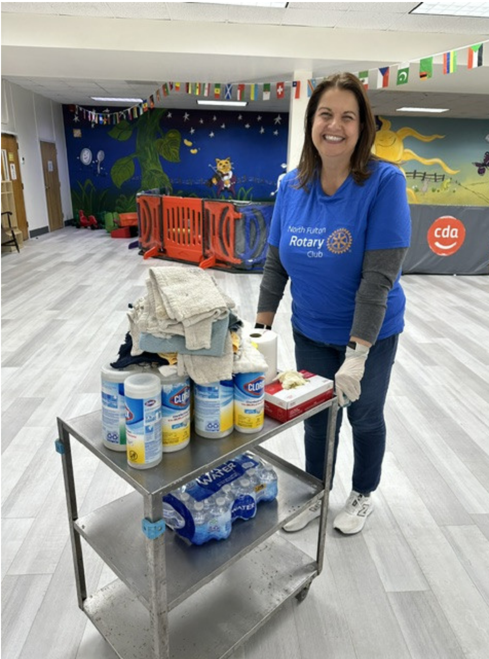
Posted by Lisa Gelber January 20, 2026