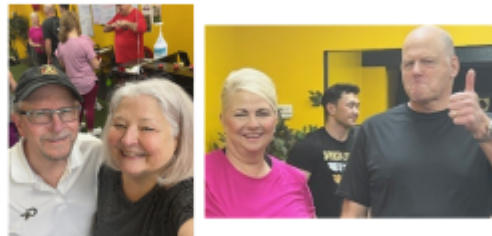
Enjoying Sweetheart Workout at Safe Haven Fitness

This is a different kind of fundraiser! I am FINALLY determined to get in shape and lose some weight to get ready for spring. I have already started exercising at this gym and I LOVE it! Safe Haven Fitness is right next to Roswell Junction. I was discussing Roswell Rotary and Service Above Self and they took the concept to a new level. If any of our members want to sign up for a 30 day reset program, they will donate the entire fee to Roswell Rotary. It's win win. We get healthier and the club gets more money for service. I have signed up and paid my $199. Please reach out to me if you are interested and I'll tell you about my experience so far. I'm so excited that we can raise money AND get fit.