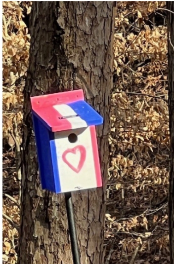
Bluebirds are starting to nest in the bird houses we built at Farm Day!