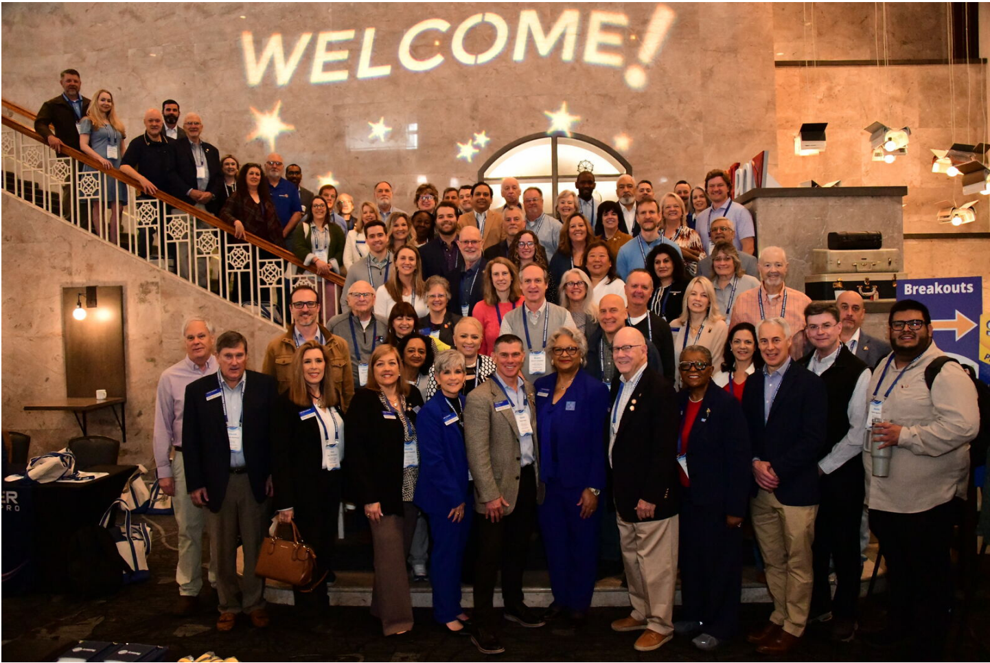
Peach State PELS - training our leaders for the 2026-27 Rotary Year