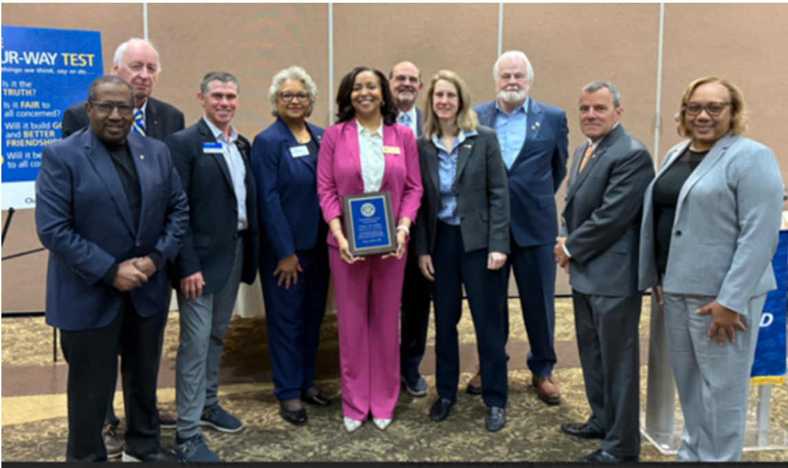
DeKalb Rotary Council Breakfast