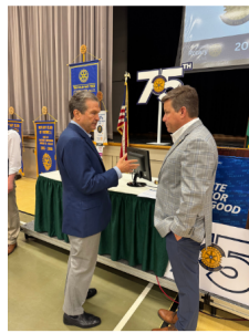
Last Week at Roswell Rotary