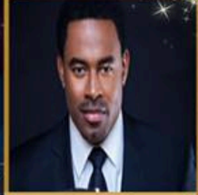
Actor Lamman Rucker