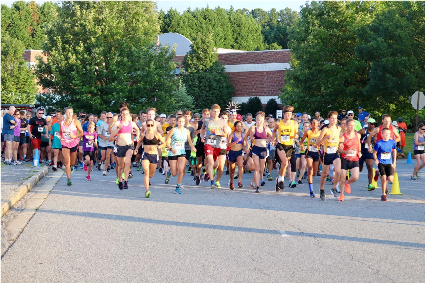
Posted by Blake Joiner September 5, 2017