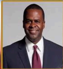
Atlanta Mayor Kasim Reed