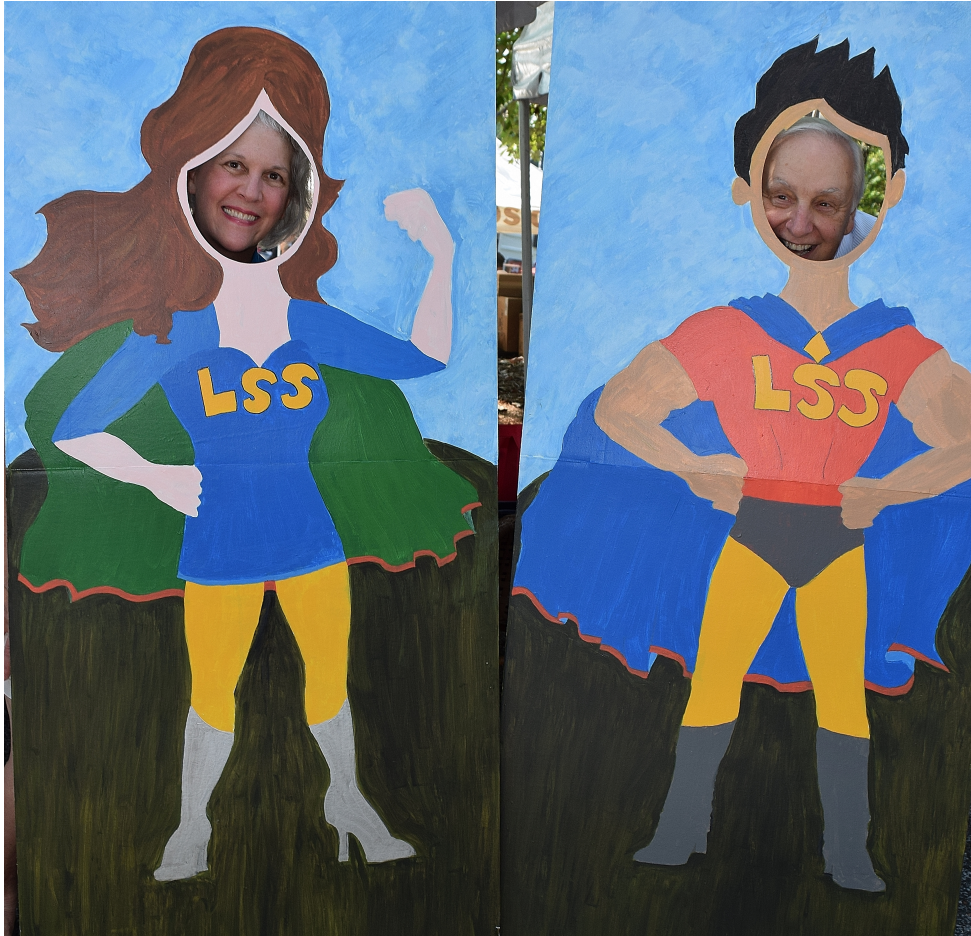
Lots of fun at the Heritage Sandy Springs' Festival. We hope everyone enjoyed volunteering at the booth and meeting up with new and old friends.