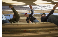
Habitat for Humanity, one of Rotary's newest service partners, builds homes for families in need, and provides opportunities for hands-on community service.