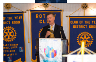
On January 22, 2018, former FBI Agent and current Sr. Management Consultant at Deerman, spoke to the Rotary Club of Sandy Springs