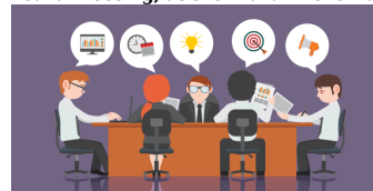
Next Week's Program