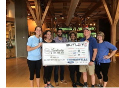
This Week's Program