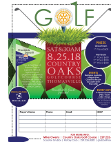
Next Week's Program