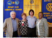
What a great WELCOME for