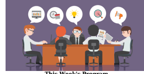
This Week's Program