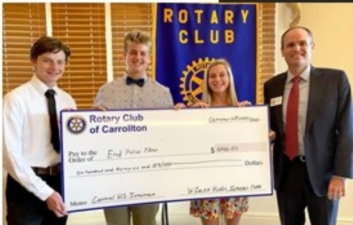
Above: Carrollton Rotary extends Many, many thanks to the Central High School Interact Club for its donation to our End Polio Now campaign!